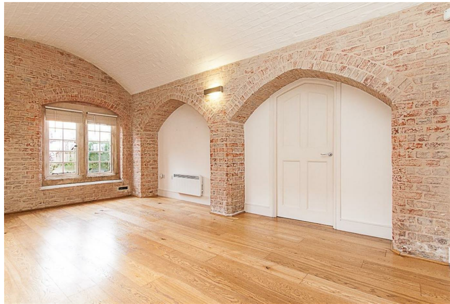
9 Kavanagh Court The Galleries, Warley, Brentwood, CM14 5FF

TOTAL APPROX. FLOOR AREA 560 SQ.FT. (52.1 SQ.M.) THIS PLAN IS FOR ROOM IDENTIFICATION ONLY, AND ITS ACCURACY IS NOT GUARANTEED. www.epcsinessex.co.uk Made with Metropix ©2017